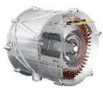
World premiere: For the first time, MAHLE is showing its SCT electric motor for particularly high continuous performance at IAA Transportation.

At the Test Drives and Plug & Play Campus in Hall 11, Stand PP40, the group is showing its chargeBIG charging infrastructure solution. With the goal of “Charging as quickly as necessary, not as quickly as possible”, chargeBIG offers scalable and cost-effective charging infrastructure for fleet operators and other areas of application from 18 to 100 or more electrified parking spaces. The charging infrastructure on display is connected to electricity and is used by well-known vehicle manufacturers who charge their test drive vehicles during the day or overnight at the trade fair. Test drivers can experience and test the charging process live on the chargeBIG charging infrastructure.